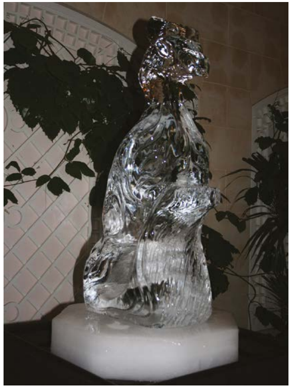
Specially created ice sculpture of the prestigious Phoenix Award.

in India, as well as new colleagues in Germany."